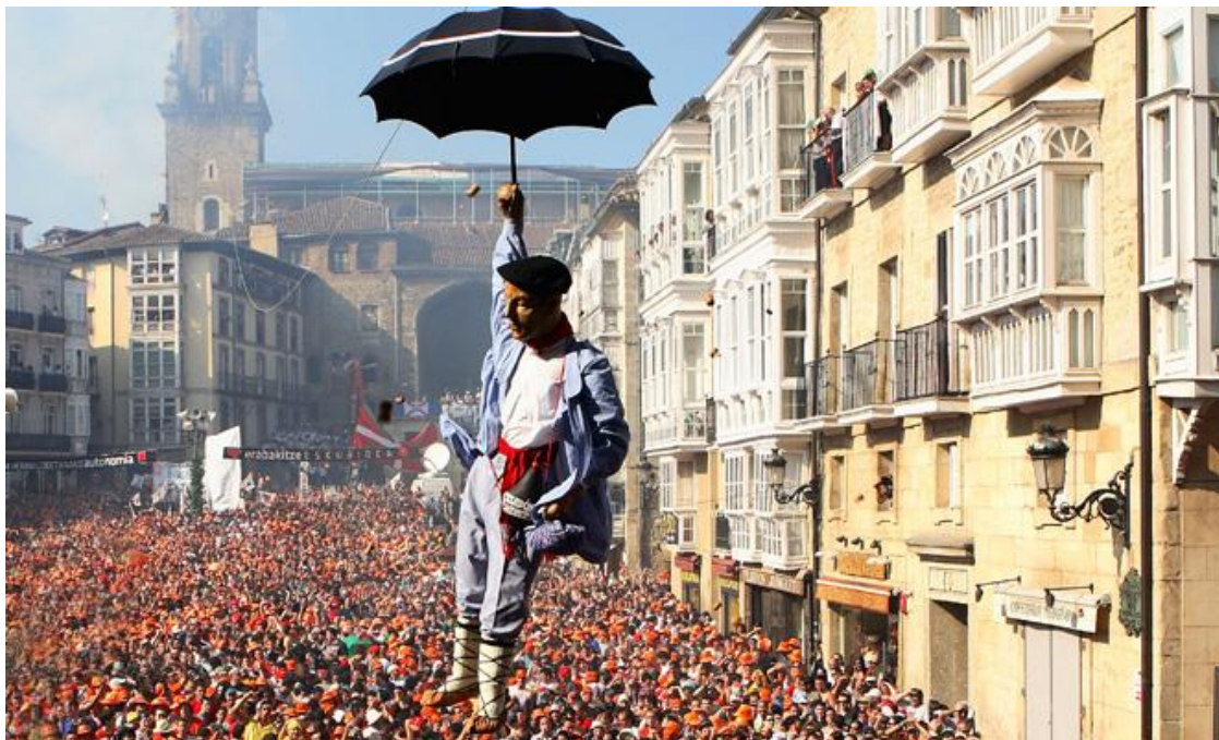
Video of the descent of Celedon character; the start point for “La Blanca” Festivals of Vitoria - Gasteiz.