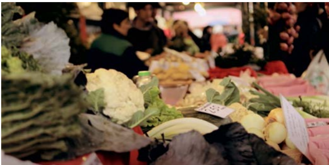
Short video of the gastronomic market of the last Monday of October in Gernika.