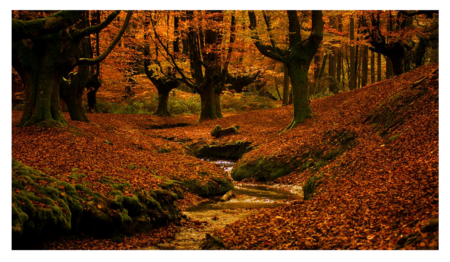
*All the content and pictures cannot be used or broadcast without the permission of Basqvium. Most of the pictures are assigned by diffrentet Basque Regional Tourism Organizations.