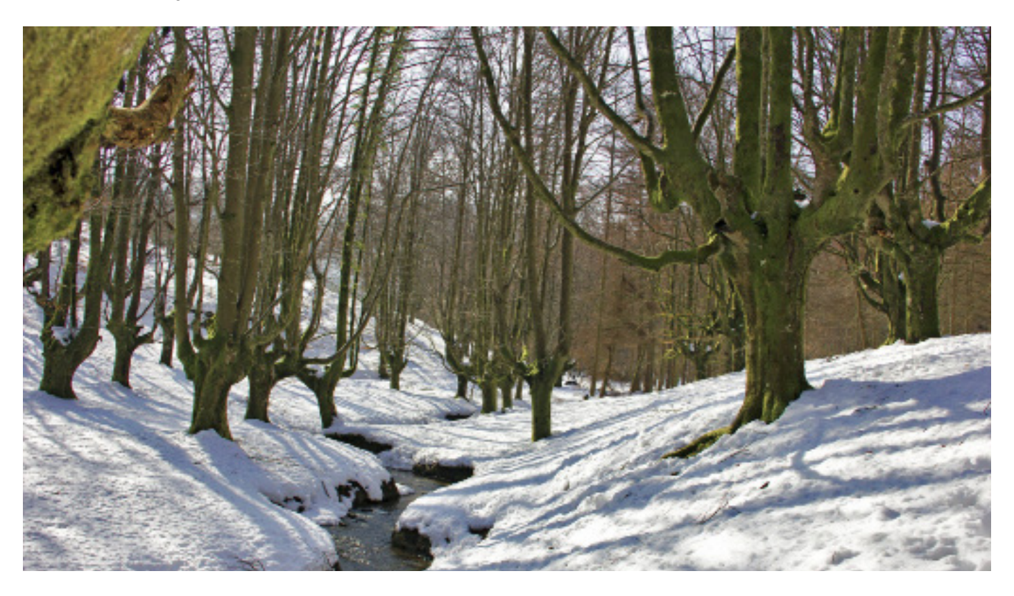
*All the content and pictures cannot be used or broadcast without the permission of Basqvium. Most of the pictures are assigned by diffrentet Basque Regional Tourism Organizations.